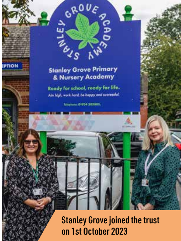
Stanley Grove joined the trust on 1st October 2023