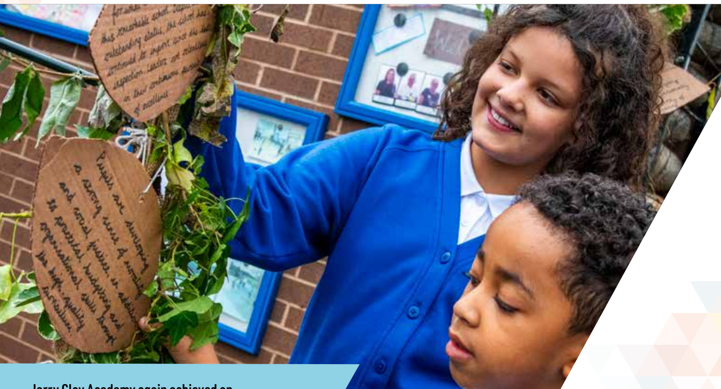
Jerry Clay Academy again achieved an 'Outstanding' Ofsted review in November 2023

Wishing staff who are leaving our trust the very best.