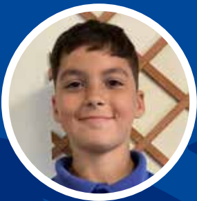
Head of Maths