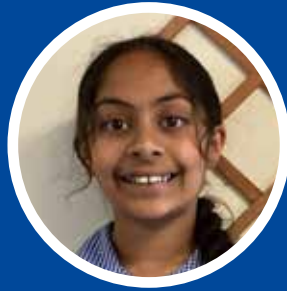
Head of Healthy School