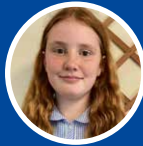
Head of Curriculum