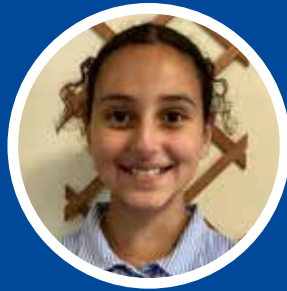
Head of Creative Arts