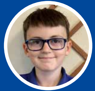
Head of Eco