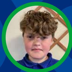
Green House Captains