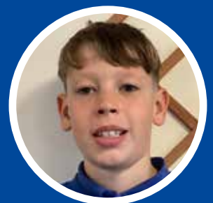
Head of Sport