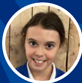
Head of Well-Being