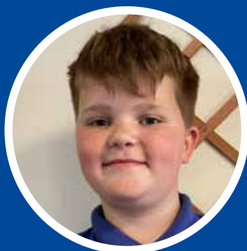
Deputy Head Boy

We wish to thank our brilliant leadership team as they move onto secondary school. They will leave behind a huge legacy of improvement.