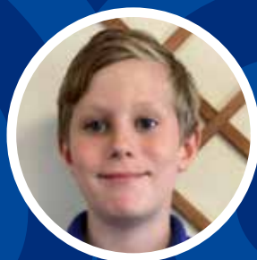
Head of Science