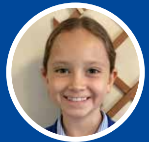
Head of Reading