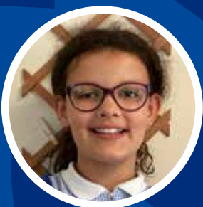
Head of School Council