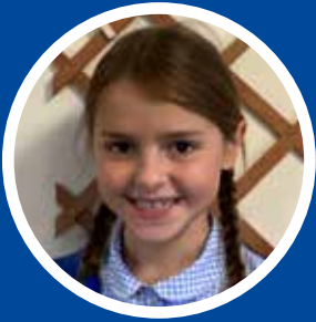
Head of English