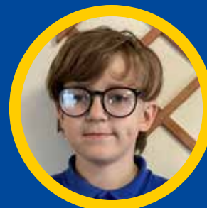
Yellow House Captains