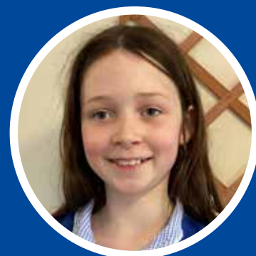
Deputy Head Girl

We now welcome our new leadership team who will all help to shape the developments of JCA next year.