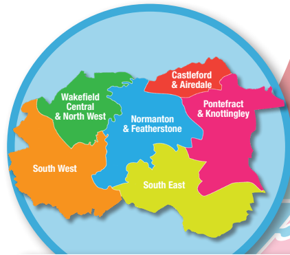
Locally based teams and services