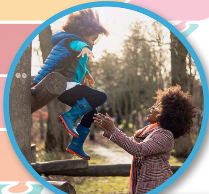
Easy access to early help