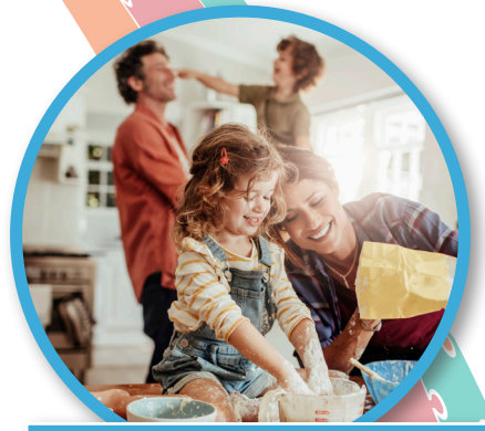
Whole family approach