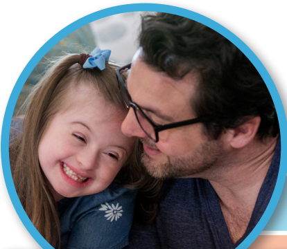
Groups and activities for all ages and needs