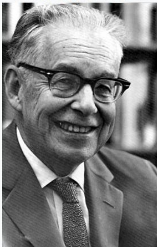
Charles Francis Richter

KS2: Children will have learnt about volcanoes and how these are formed in Year 3. They will know locations of continents and countries across the world.