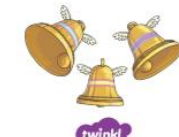
twinkl visit twinkl.com